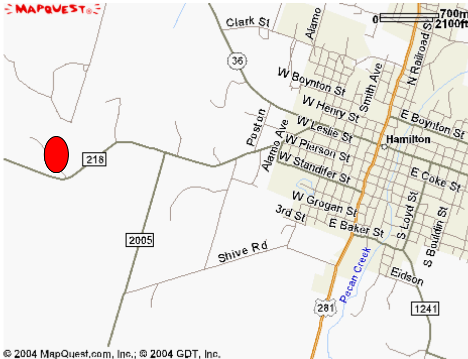
Directions to Hamilton